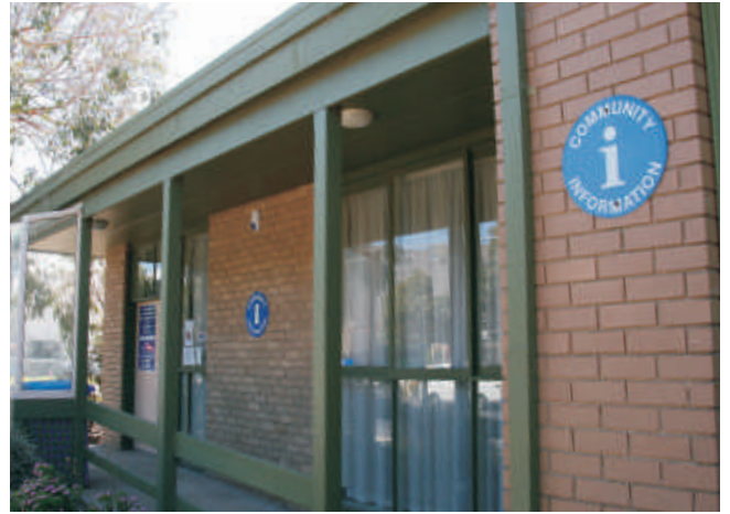
Melway Ref 76 G9