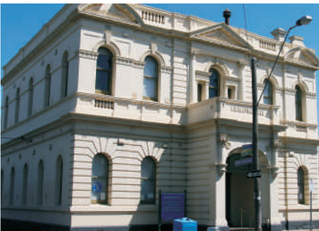
Melway Ref 67 E9