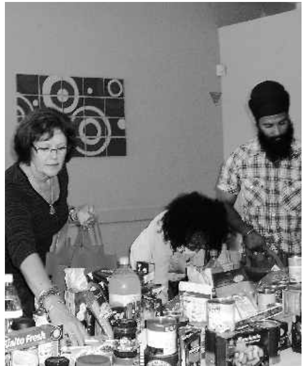
Volunteers help pack Christmas hampers