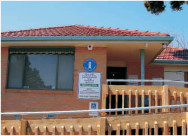
Melway Ref 77 D5