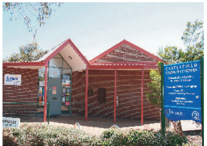
Melway Ref 77A4